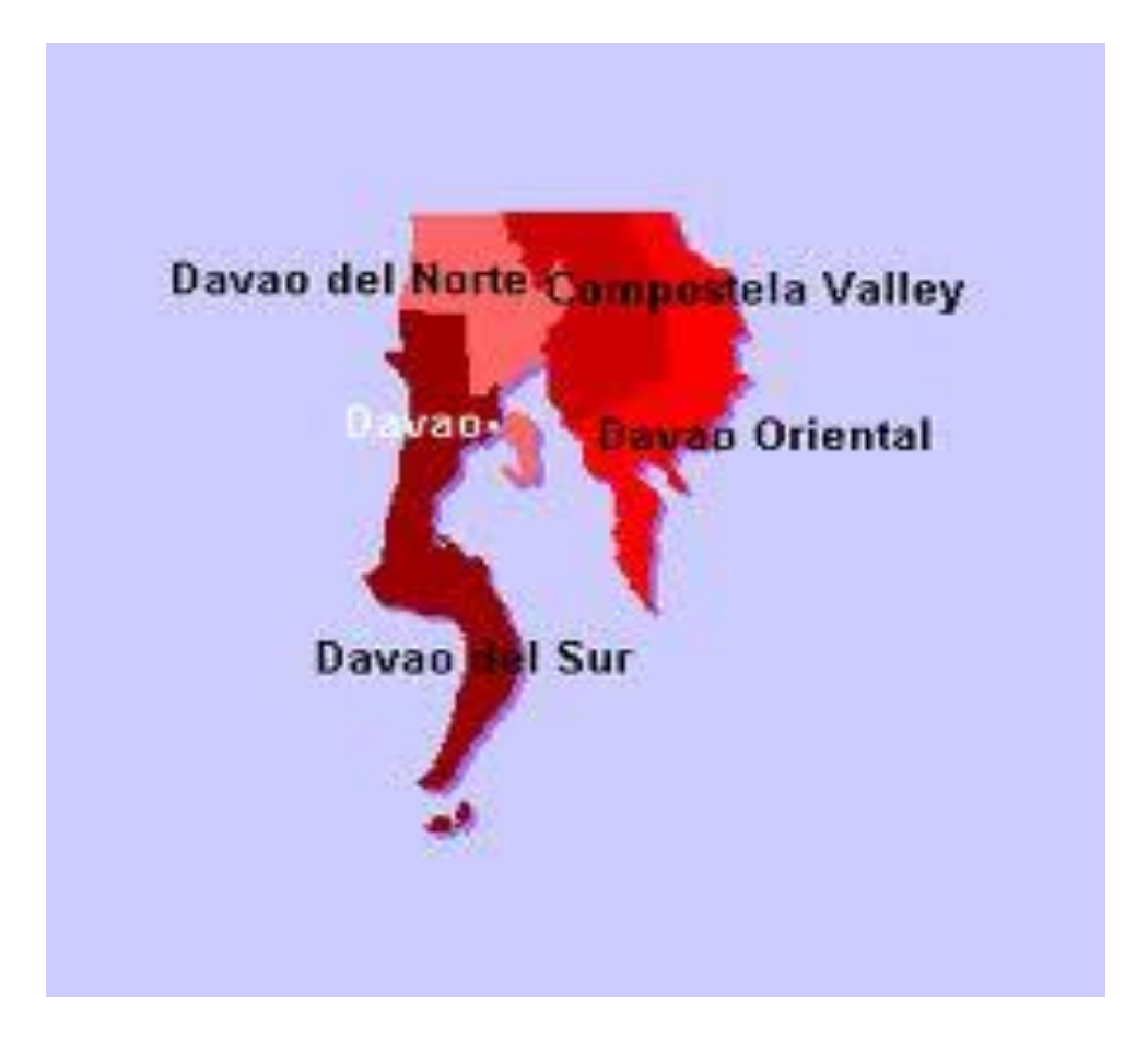
Figure 3. Showing the Geographical Spot of the area involved in the Study of Region XI.

Vol. 2, Issue 4, pp: (22-61), Month: July - August 2015, Available at: www.noveltyjournals.com